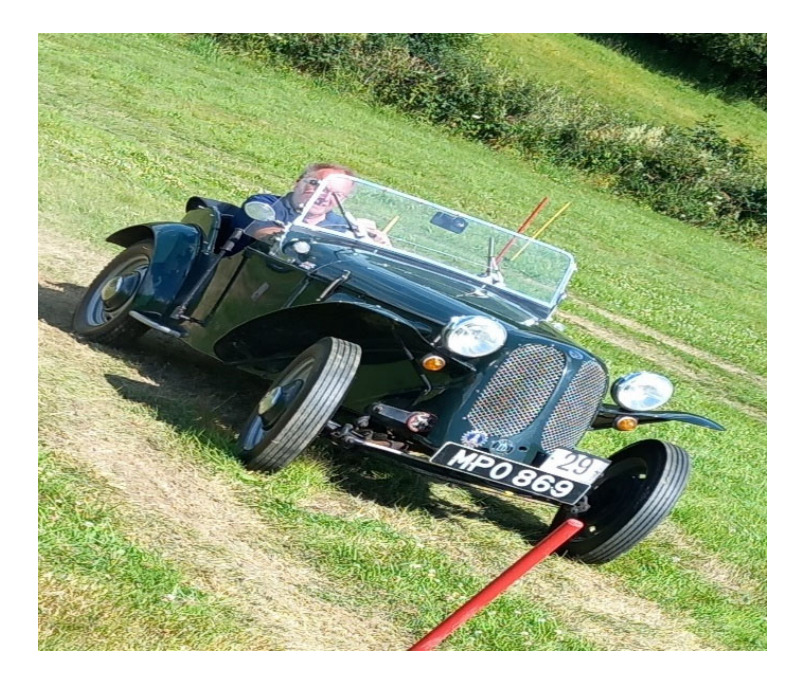
That's odd, the sun is shining on the Dellow, but it's raining on the Liege, I suppose he could be hiding from the glare of the sun, tricky to see where you're going though.